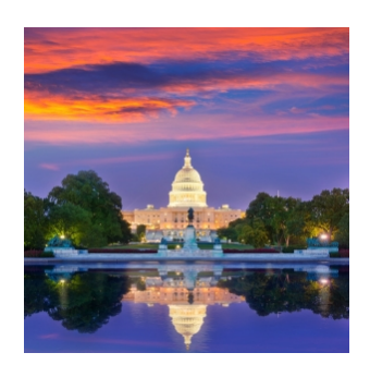
This legislation expands savings opportunities for workers and includes new requirements and incentives for employers that provide retirement benefits.

In 2019, only about half of people who worked for small businesses with fewer than 50 employees had access to retirement benefits.¹ The SECURE Act includes provisions intended to make it easier and more affordable for small businesses to provide qualified retirement plans.